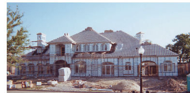
• Insect resistant Total Wall Exterior Insulation System