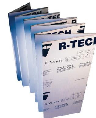
• Insect resistant R-Tech Fanfold Insulation