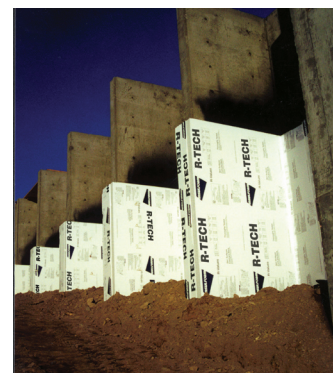
• Insect resistant R-Tech Cavity Wall & Perimeter Foundation Insulation