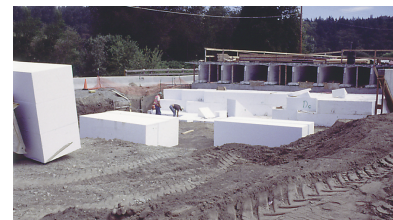
• Insect resistant InsulFoam GF (Geofoam)