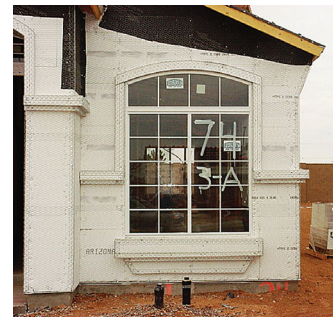
• Insect resistant One-Coat Stucco T&G Insulation