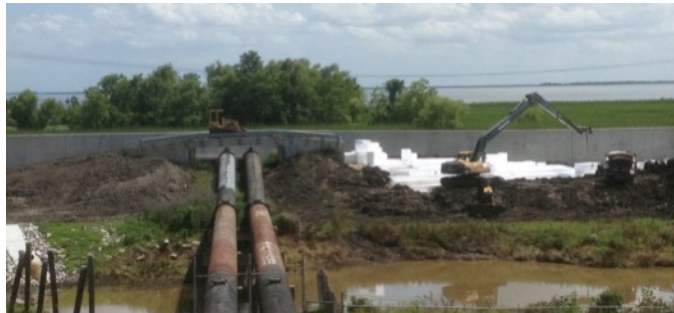
EPS19 was installed on both the East and West abutments of the USACE Lake Cataouatche Pump Station in Avondale, LA

Another slope stabilization project was part of ongoing efforts to keep the low-lying New Orleans metro area dry, the U.S. Army Corps of Engineers completed improvements to a pumping station that drains the town of Avondale to Lake Cataouatche. The project included construction of a vehicle bridge over the station's above-ground, large diameter