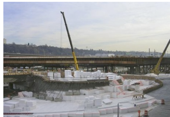
Utility protection & bridge approach support for Seattle's SR-519

Throughout the world, we have a tremendous amount of existing buried utilities. Often, we want to build new structures over them, but those utilities were never designed or intended to have additional loads placed upon them. In these situations, the utilities either have to be moved or upgraded at high expense. For such applications, geofoam can be an ideal option to reduce dead and lateral loads on those underground pipes, culverts and tunnels, while at the same time providing high thermal insulation values that protect against temperature fluctuations.