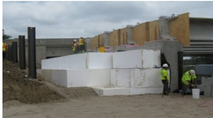
EPS Geofoam blocks create retaining wall for bridge widening project in Omaha, NE

Using EPS Geofoam also reduces labor and material costs without the need for over excavation, and requires much less robust forming, reduced structural steel and concrete wall thickness, and fewer footings. The material can also reduce or eliminate the need for geo-grids and/or mechanical tiebacks. Project teams are able to construct a retaining wall with EPS Geofoam paired with a lower-cost fascia (which acts more like a fence).