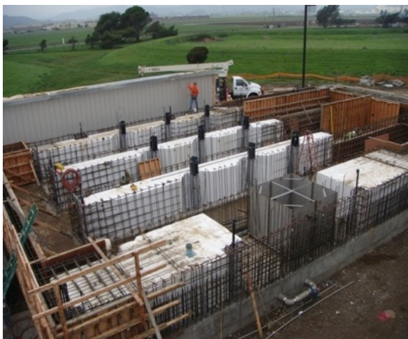
EPS Geofoam provides a fast and simple way to form concrete walls as seen in these water channels in a California water treatment plant.

A project example is construction of water channel walls in the Fairfield-Suisun Sewer District (California) water treatment plant (pictured at right). Typical construction of such walls involves two-sided forming then filling the void with soil, sand or concrete slurry and completing a second concrete pour for a topping slab. To simplify and speed the work, the contractor instead used 90 cubic yards of EPS Geofoam. The geofoam blocks constituted half of the form, which simultaneously filled the void, plus easily bore the weight of the concrete topping slab. This enabled a monolithic pour of the channel tops and walls at the same time, which significantly reduced forming labor, material costs and accelerated the concrete pouring schedule.