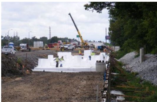
Geofoam blocks aid the widening of the I-80 / I-65 interchanges in Gary, Indiana

One such project was the renovation of the Renton City Hall in Renton, Washington. To meet building codes, new handicap ramps were required. The building is surrounded by extremely soft soils, so the ramps needed a very lightweight foundation to avoid post-construction settlement. After evaluating various traditional fills, the city chose EPS Geofoam.