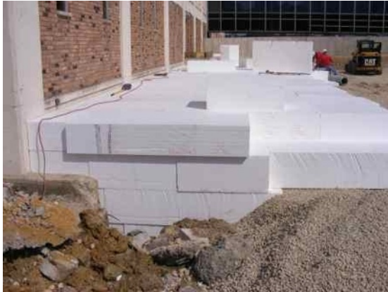
EPS Geofoam blocks provide zero lateral load back fill on the KBS hospital in Dixon, IL

formed and extended the wall, using approximately 2,000 cubic yards of EPS Geofoam as lightweight back fill for the bridge approach.