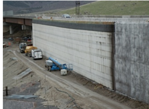
Shotcrete being applied on the vertical facia walls of the Topaz Bridge in McCammon, ID