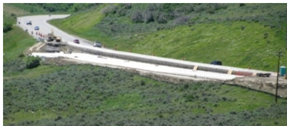
EPS Geofoam used for slope stabilization on the US 50 in CO.

The first geofoam slope stabilization project in North America was designed by Yeh and Associates and completed in 1989, where a section of US160 near Durango, CO had failed causing a lane closure. Approximately 850 cubic yards of geofoam was used and installed in a very short period of time allowing the road to be opened to traffic once again.