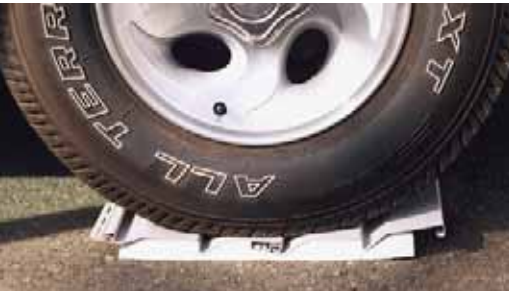
Vinyl Siding with InsulFoam Profile